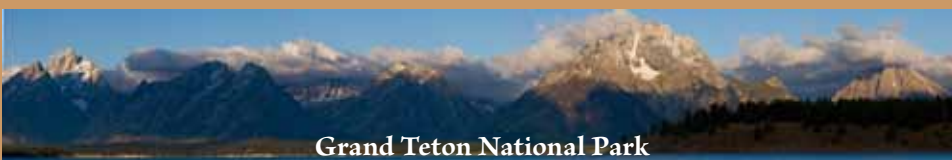
Grand Teton National Park